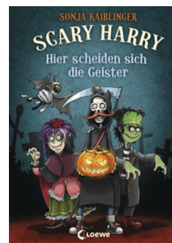
Scary Harry – Strife Among the Spooks (Vol. 5)