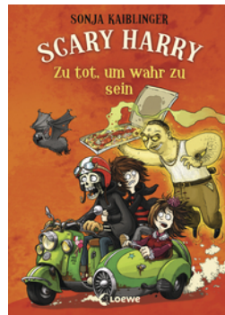
Scary Harry – Too Dead to be True (Vol. 8)