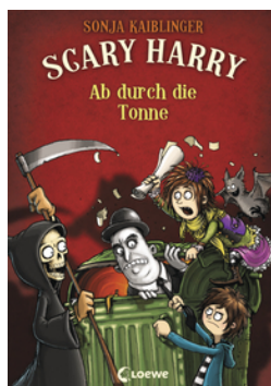
Scary Harry – Down the Can (Vol. 4)