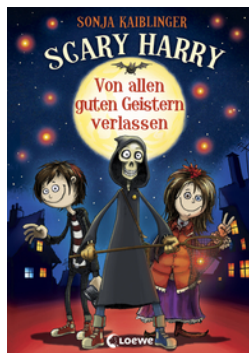
Scary Harry – Takes Leave of his Senses (Vol. 1)