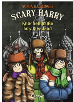
Scary Harry – Bony Greetings from Russia (Vol. 7)