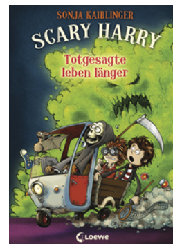
Scary Harry – The Reported Dead Live Longer (Vol. 2)