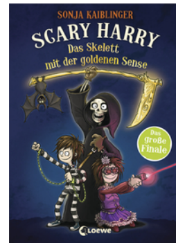
Scary Harry – The Skeleton with the Golden Scythe (Vol. 9)