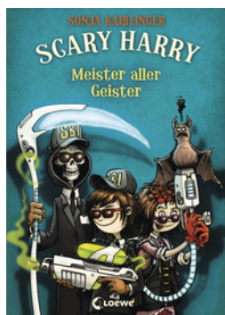
Scary Harry – Master of All Ghosts (Vol. 3)