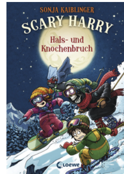
Scary Harry – Break a Legbone (Vol. 6)