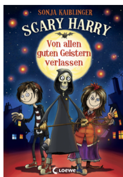
Scary Harry – Takes Leave of his Senses (Vol. 1)