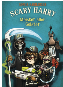
Scary Harry – Master of All Ghosts (Vol. 3)