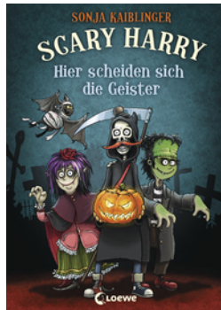
Scary Harry – Strife Among the Spooks (Vol. 5)