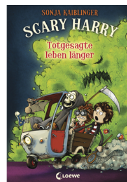
Scary Harry – The Reported Dead Live Longer (Vol. 2)