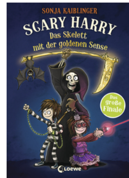
Scary Harry – The Skeleton with the Golden Scythe (Vol. 9)