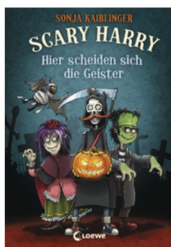
Scary Harry – Strife Among the Spooks (Vol. 5)