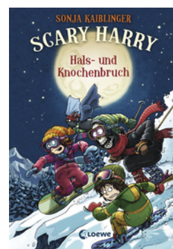
Scary Harry – Break a Legbone (Vol. 6)