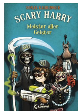
Scary Harry – Master of All Ghosts (Vol. 3)