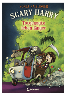
Scary Harry – The Reported Dead Live Longer (Vol. 2)