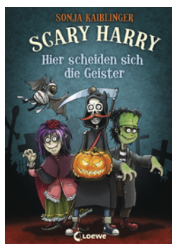
Scary Harry – Strife Among the Spooks (Vol. 5)