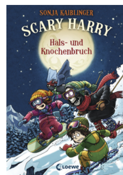
Scary Harry – Break a Legbone (Vol. 6)