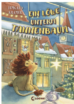
A Lion under the Christmas Tree