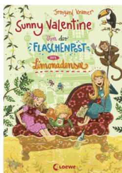
Sunny Valentine – Message in a Bottle in the Lemonade Lake (Vol. 3)