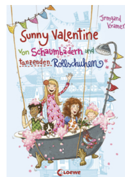
Sunny Valentine – Foam Baths and Dancing Roller-Skates (Vol. 2)