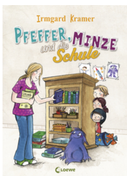
Pepper, Mint and School (Vol. 1)