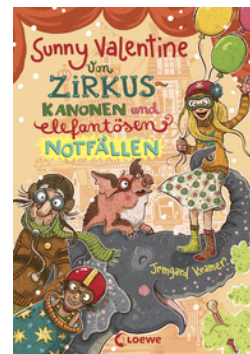
Sunny Valentine – Circus Cannons and Elephantine Emergencies (Vol. 4)