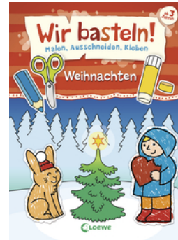
Let's Do Arts & Crafts! - Christmas