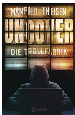
Uncover - The Troll Farm