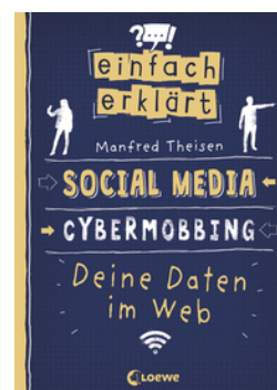
Simply Explained – Social Media, Cyber-Bullying, Your Data on the Web