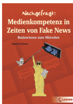
A Guide to Media Literacy in Times of Fake News