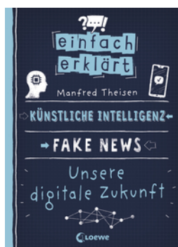
Simply explained - Artificial Intelligence - Fake News - Our Digital Future