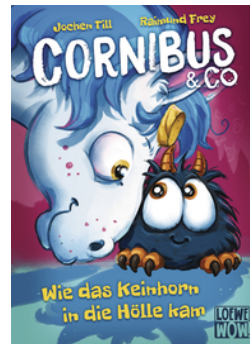
Cornibus & Co. - How the No-Unicorn Came to Hell (Vol. 4)