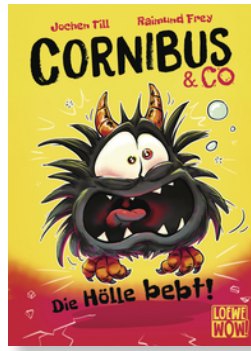
Cornibus & Co. - Hell Quakes (Vol. 3)