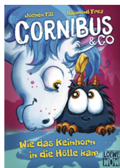
Cornibus & Co. - How the No-Unicorn Came to Hell (Vol. 4)