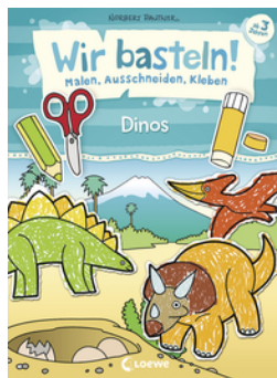
Let's Do Arts & Crafts! - Dinosaurs