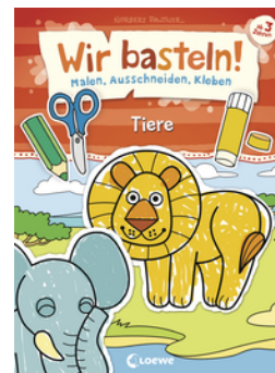
Let's Do Arts and Crafts! - Animals