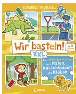
Let's do Arts and Crafts! XXL - The most beautiful designs to paint, cut out and glue (yellow)