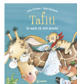
Tafiti – That’s How You Get Well