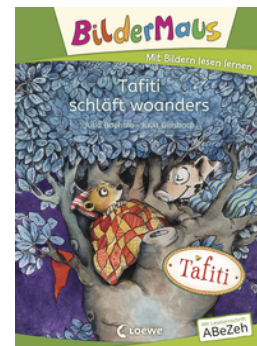
Picture Mouse - Tafiti Sleeps Somewhere Else