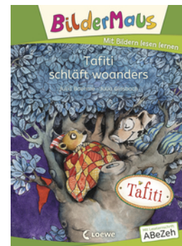
Picture Mouse - Tafiti Sleeps Somewhere Else