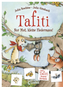
Tafiti – Be Brave, Little Bat!