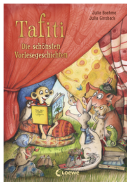
Tafiti – The Best Story Time Adventures for Reading Together