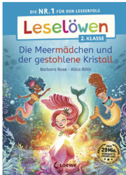
Reading Lions (Year 2) – The Sea Girls and the Stolen Crystal