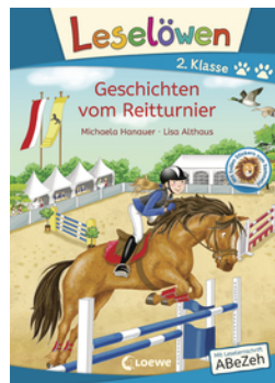
Horse Show Stories