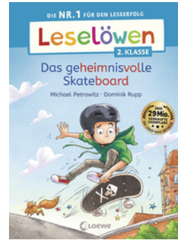
Reading Lions (Year 2) – The Mysterious Skateboard