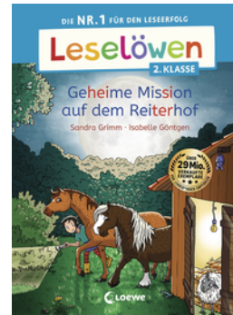
Reading Lions (Year 2) - Secret Mission at the Riding Stable