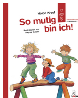
I Can Be Brave - Overcoming Fear, Finding Confidence, and Asserting Yourself