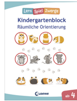
Little Quiz Dwarfs - Spatial Orientation