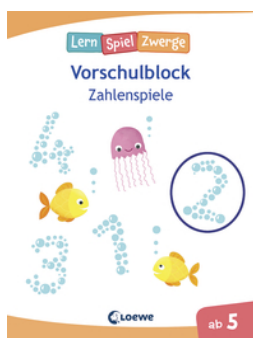
Little Quiz Dwarfs - Number Games