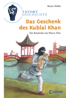
History Mysteries - Kublai Khan's Present