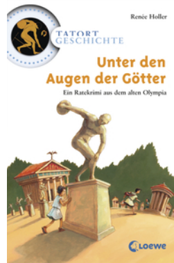
History Mysteries - Under the Eyes of the Gods