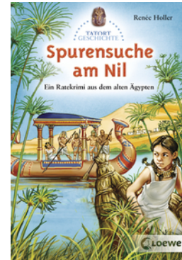
History Mysteries - Robbers on the Nile