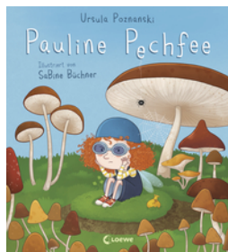
Pauline the Flop-Fairy