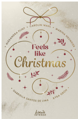
Feels Like Christmas