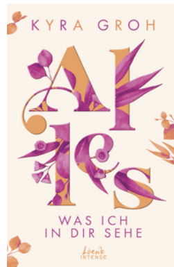
All That I See In You