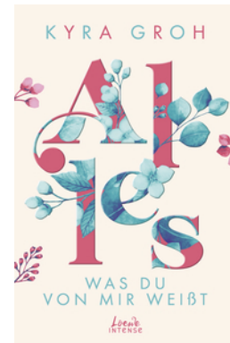
All That You Know About Me