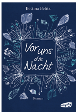
The Night Lies Ahead