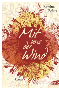
The Wind With Us