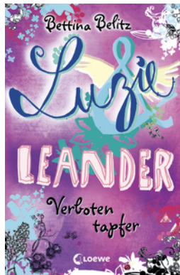
Lucie & Leander - Courageously Wicked (Vol. 6)