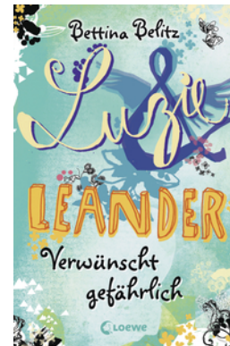
Lucie & Leander – Dangerously Accursed (Vol. 5)