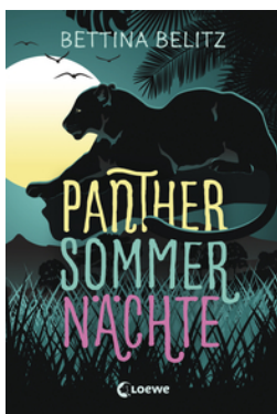
Panther Summer Nights