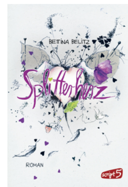
A Splintered Heart (Paperback Edition)