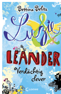
Lucy & Leander – Suspiciously Clever (Vol. 7)