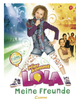
Here Comes Lola! My Best Friends