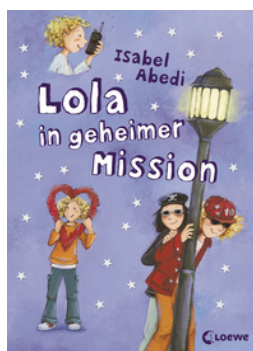
Lola's Secret Mission (Vol. 3)