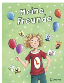
My Best Friends