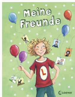
My Best Friends