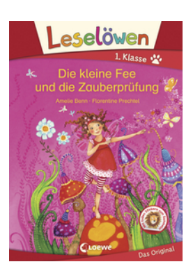
The Little Fairy and the Magic Exam