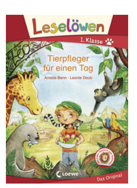
Zoo Keeper for a Day