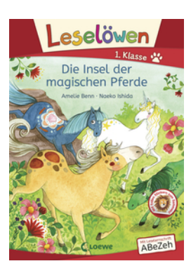
Reading Lions Year 1 - The Island of Magical Horses