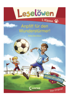
Reading Lions Year 1 - Kick-off for the Ace Striker!