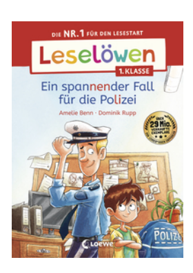
Reading Lions (Year 1) - An Exciting Case for the Police