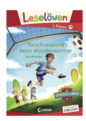
Ace Striker in Goal-Scoring Panic