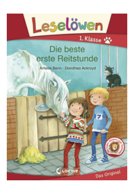
The Best First Riding Lesson