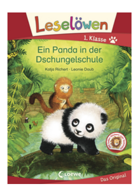
A Panda in the Jungle School