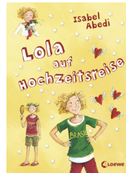
Lola on Honeymoon (Vol. 6)