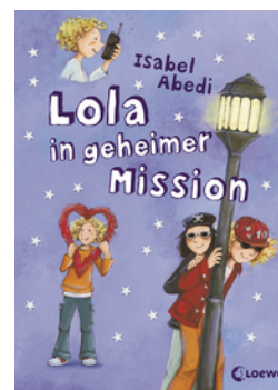
Lola's Secret Mission (Vol. 3)