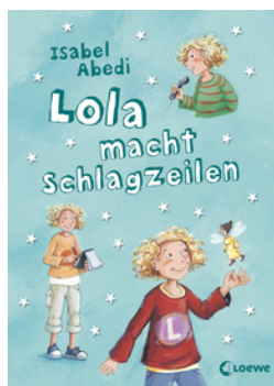
Lola Makes Headline News (Vol. 2)