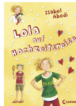
Lola on Honeymoon (Vol. 6)