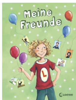
My Best Friends