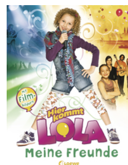
Here Comes Lola! My Best Friends