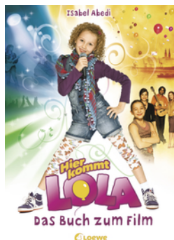
Here Comes Lola! (Movie Book)