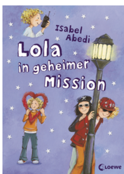
Lola's Secret Mission (Vol. 3)