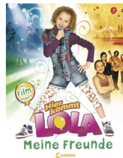
Here Comes Lola! My Best Friends