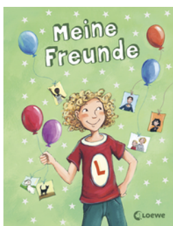
My Best Friends