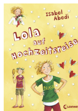
Lola on Honeymoon (Vol. 6)