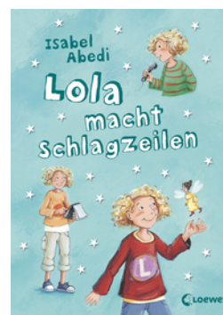
Lola Makes Headline News (Vol. 2)