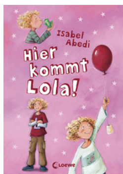
Here Comes Lola! (Vol. 1)