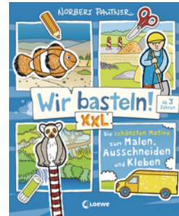
Let's Do Arts & Crafts! XXL - The most beautiful designs to paint, cut out and glue (blue)