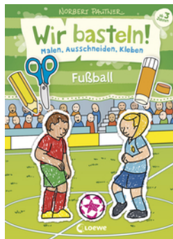
Let's Do Arts and Crafts! - Football