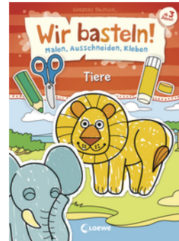
Let's Do Arts and Crafts! - Animals