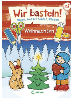
Let's Do Arts & Crafts! - Christmas