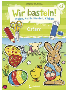
Let's Do Arts and Crafts! - Easter