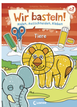
Let's Do Arts and Crafts! - Animals