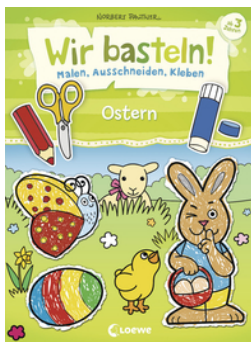
Let's Do Arts and Crafts! - Easter