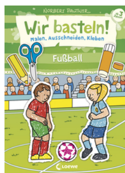
Let's Do Arts and Crafts! - Football