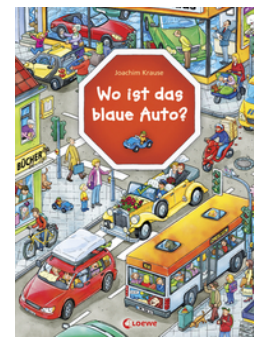
Can You Find the Blue Car?