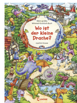
Where Is ... The Little Dragon?