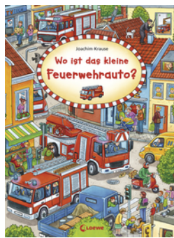
Where Is ... The Little Fire Truck?