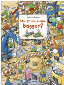
Where Is ... The Little Digger?