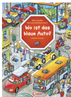
Where Is ... The Blue Car?