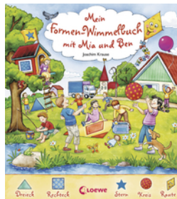
Search and Find – Shapes with Mia and Ben