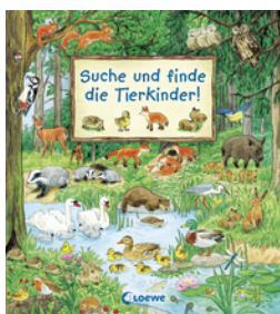
Can You Find the Animal Babies?