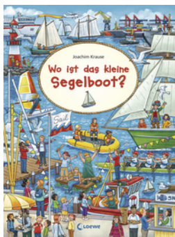
Where Is ... The Little Sail Boat?