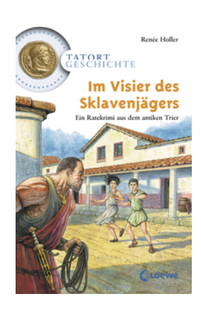
History Mysteries - Eyed by the Slave Hunter