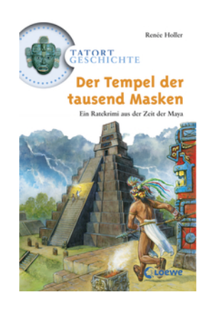
History Mysteries - The Temple of Thousand Masks