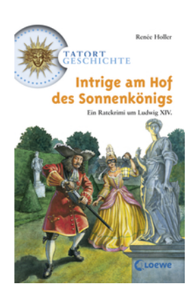
History Mysteries - Intrigue at the Sun King's Court