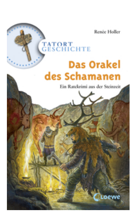
History Mysteries -The Shaman's Oracle