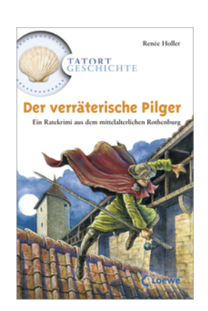
History Mysteries - The Treacherous Pilgrim