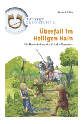
History Mysteries - Attack in the Sacred Grove