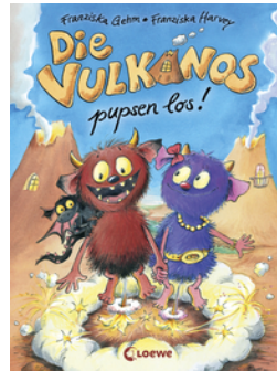
The Vulkanos Fart Away! (Vol. 1)