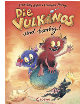
The Vulkanos Are Smashing! (Vol. 2)