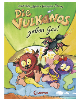
The Vulkanos Give it Some Gas! (Vol. 5)