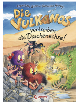
The Vulkanos Chase Away the Dragon Lizard! (Vol.8)