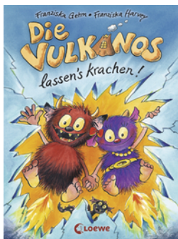
The Vulkanos Let It Rip! (Vol. 3)