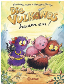
The Vulkanos Fire Up! (Vol. 6)