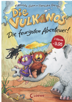
The Vulkanos – Their Most Explosive Adventures