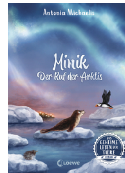
The Secret Life of Animals – Minik: Call of the Arctic (Ocean, Vol. 2)