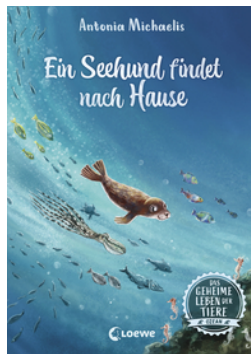
The Secret Life of Animals - Minik: A Seal Finds its Way Home (Ocean, Vol. 4)