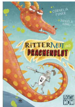
Knighthood and Dragon's Blood