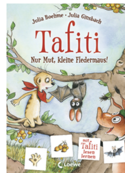
Tafiti – Be Brave, Little Bat!