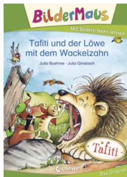
PictureMouse - Tafiti and the Lion with the Wobbly Tooth