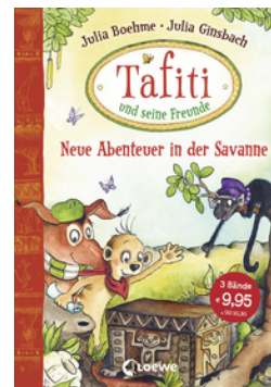
Tafiti and His Friends - New Adventures in the Savannah (Vol. 4-6)