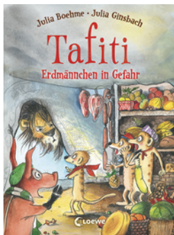
Tafiti - Meerkats in Danger (Vol. 23)