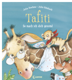
Tafiti – That's How You Get Well