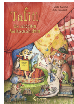
Tafiti – The Best Story Time Adventures for Reading Together