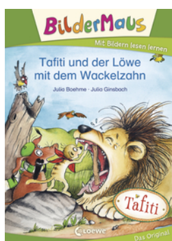
PictureMouse - Tafiti and the Lion with the Wobbly Tooth