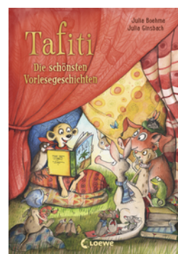
Tafiti – The Best Story Time Adventures for Reading Together