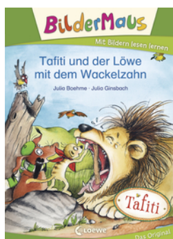
PictureMouse - Tafiti and the Lion with the Wobbly Tooth