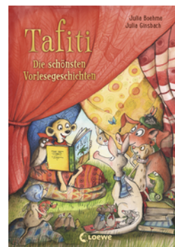
Tafiti – The Best Story Time Adventures for Reading Together