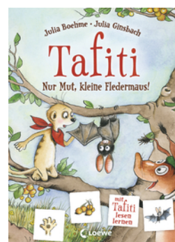
Tafiti – Be Brave, Little Bat!