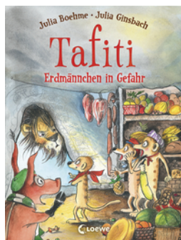
Tafiti - Meerkats in Danger (Vol. 23)