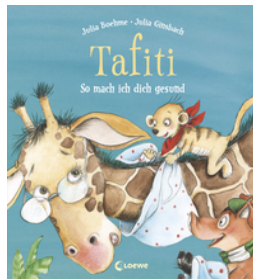
Tafiti – That's How You Get Well