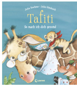
Tafiti – That's How You Get Well