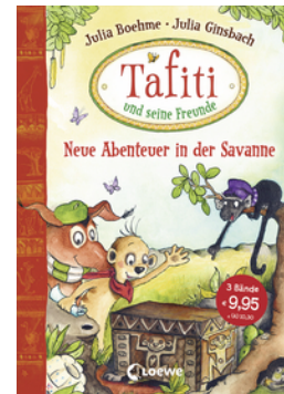
Tafiti and His Friends - New Adventures in the Savannah (Vol. 4-6)