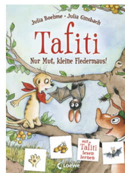
Tafiti – Be Brave, Little Bat!