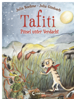
Tafiti - Pinsel under Suspicion (Vol. 22)