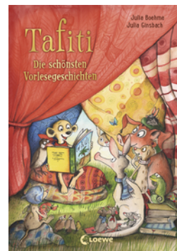
Tafiti – The Best Story Time Adventures for Reading Together