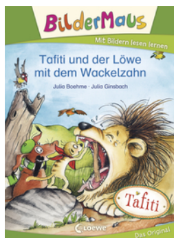
PictureMouse - Tafiti and the Lion with the Wobbly Tooth