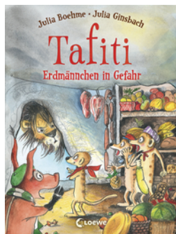
Tafiti - Meerkats in Danger (Vol. 23)