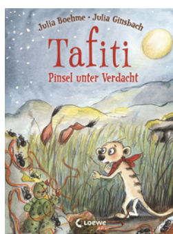
Tafiti - Pinsel under Suspicion (Vol. 22)