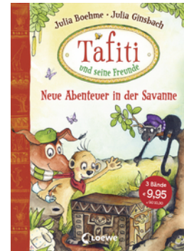
Tafiti and His Friends - New Adventures in the Savannah (Vol. 4-6)