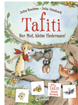
Tafiti – Be Brave, Little Bat!