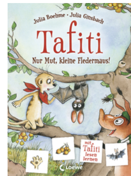
Tafiti – Be Brave, Little Bat!