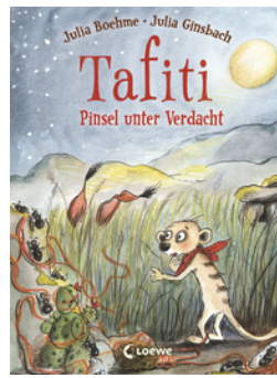
Tafiti - Pinsel under Suspicion (Vol. 22)