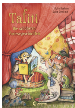
Tafiti – The Best Story Time Adventures for Reading Together