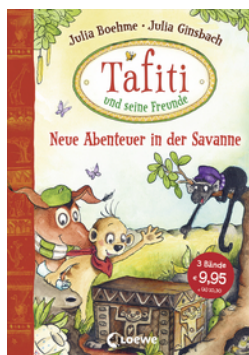
Tafiti and His Friends - New Adventures in the Savannah (Vol. 4-6)