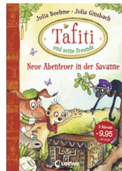
Tafiti and His Friends - New Adventures in the Savannah (Vol. 4-6)