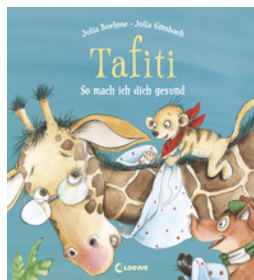
Tafiti – That's How You Get Well