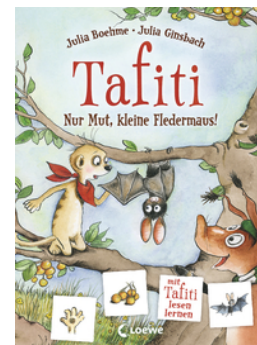
Tafiti – Be Brave, Little Bat!