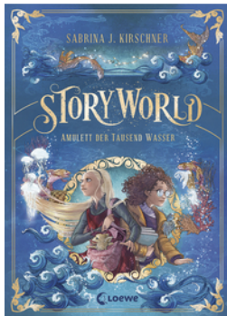
StoryWorld – Amulet of a Thousand Waters (Vol. 1)