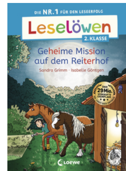
Reading Lions (Year 2) - Secret Mission at the Riding Stable