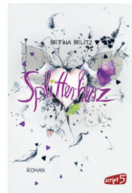
A Splintered Heart (Paperback Edition)