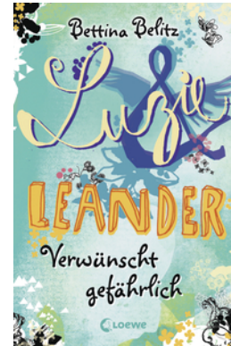
Lucie & Leander – Dangerously Accursed (Vol. 5)