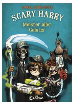
Scary Harry – Master of All Ghosts (Vol. 3)