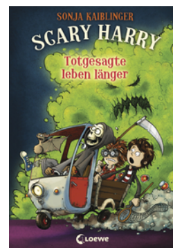
Scary Harry – The Reported Dead Live Longer (Vol. 2)