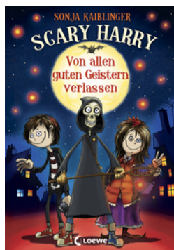
Scary Harry – Takes Leave of his Senses (Vol. 1)