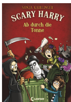
Scary Harry – Down the Can (Vol. 4)