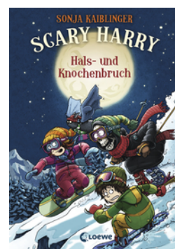
Scary Harry – Break a Legbone (Vol. 6)