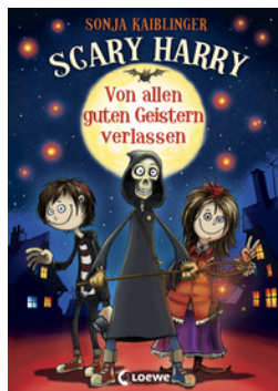
Scary Harry – Takes Leave of his Senses (Vol. 1)