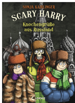
Scary Harry – Bony Greetings from Russia (Vol. 7)