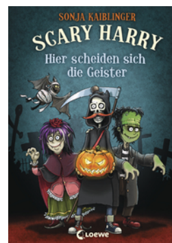
Scary Harry – Strife Among the Spooks (Vol. 5)