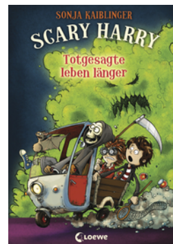
Scary Harry – The Reported Dead Live Longer (Vol. 2)