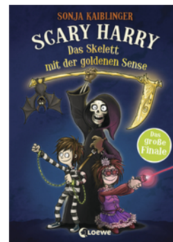
Scary Harry – The Skeleton with the Golden Scythe (Vol. 9)