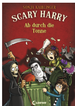
Scary Harry – Down the Can (Vol. 4)