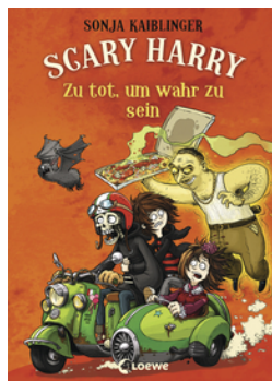
Scary Harry – Too Dead to be True (Vol. 8)