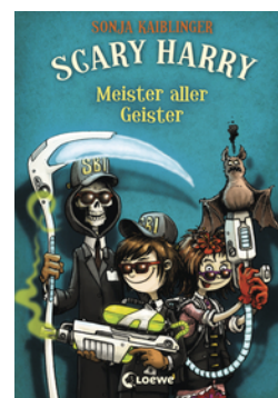
Scary Harry – Master of All Ghosts (Vol. 3)