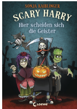
Scary Harry – Strife Among the Spooks (Vol. 5)