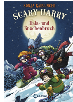
Scary Harry – Break a Legbone (Vol. 6)