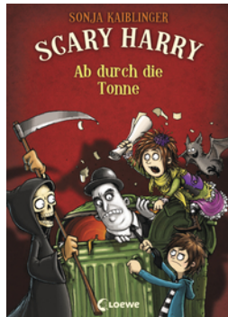
Scary Harry – Down the Can (Vol. 4)